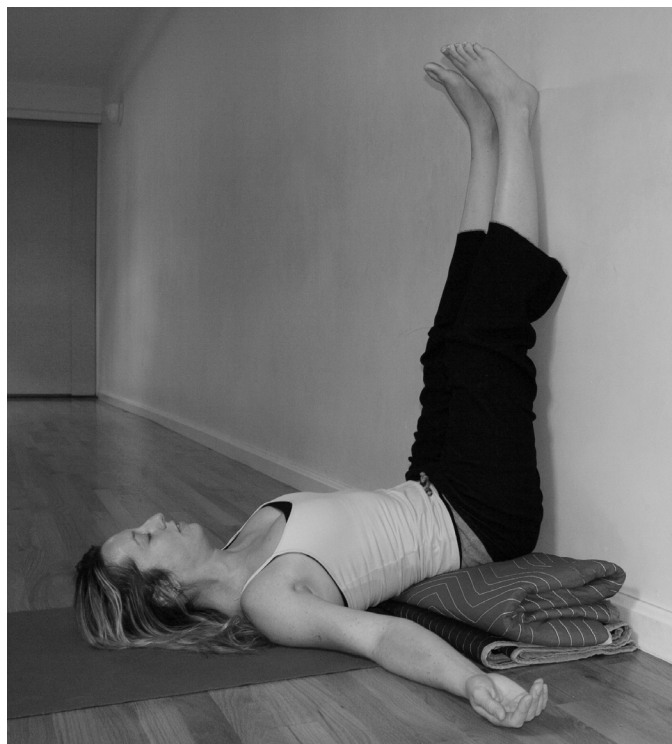
Figure 4. Legs-up-the-Wall Pose