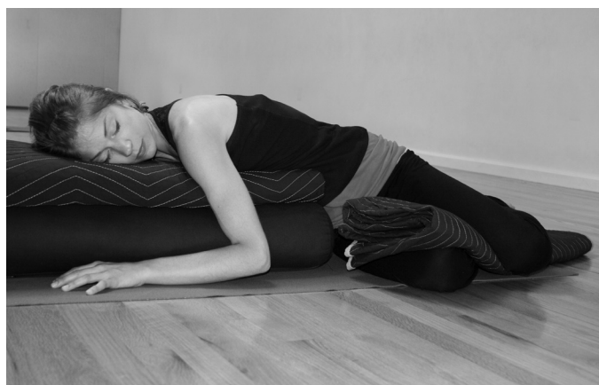
Figure 2. Supported Reclining Twist