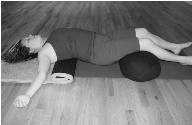
Figure 6. Supported Gentle Backbend