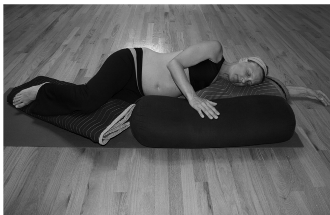
Figure 3. Side-Lying Pose